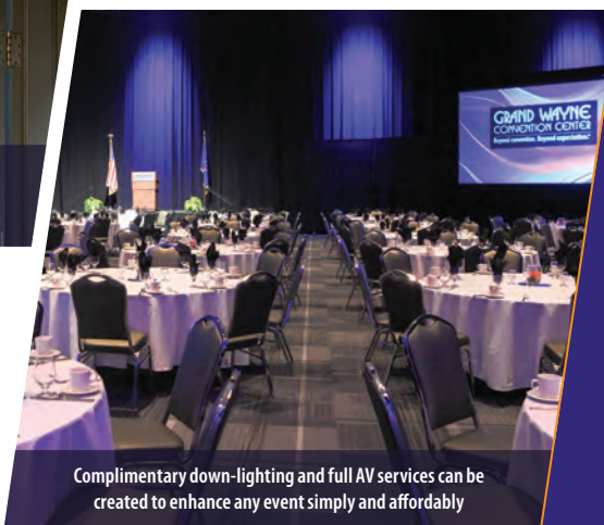
Complimentary down-lighting and full AV services can be created to enhance any event simply and affordably