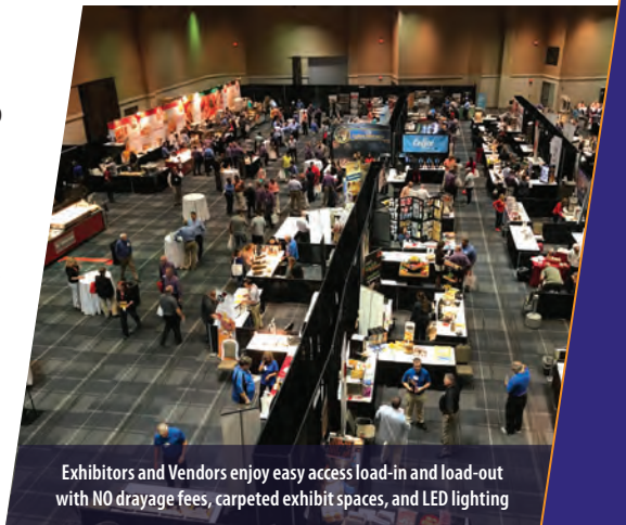
Exhibitors and Vendors enjoy easy access load-in and load-out with NO drayage fees, carpeted exhibit spaces, and LED lighting