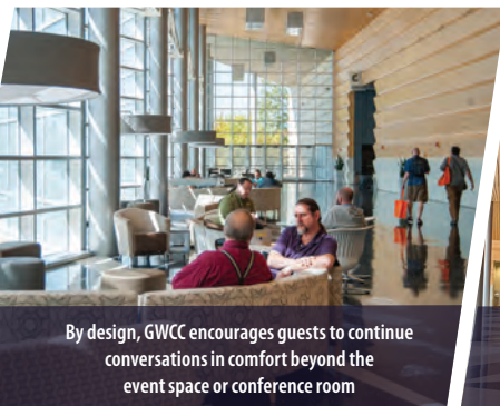
By design, GWCC encourages guests to continue conversations in comfort beyond the event space or conference room