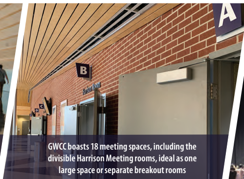
GWCC boasts 18 meeting spaces, including the divisible Harrison Meeting rooms, ideal as one large space or separate breakout rooms