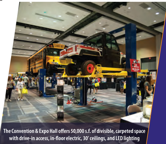
The Convention & Expo Hall offers 50,000 s.f. of divisible, carpeted space with drive-in access, in-floor electric, 30' ceilings, and LED lighting