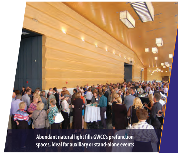
Abundant natural light fills GWCC's prefunction spaces, ideal for auxiliary or stand-alone events